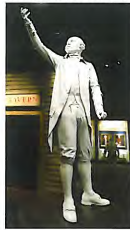
A sculpture of Patrick Henry, specially made for this museum.