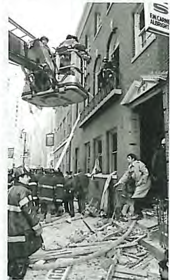
The aftermath along Broad Street. Note the corner FT sign in the background.

Of note, before granting commutation, the White House apparently did not consult the families of the Fraunces Tavern dead nor the survivors of the blast, some of whom were permanently maimed. ■