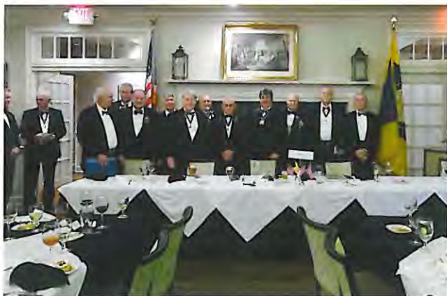
The newly installed 2017-18 State Society officers.