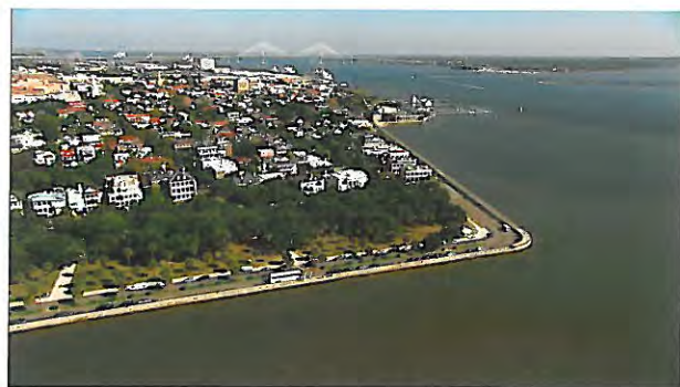
The city is located on the tip of the Charleston Peninsula, at the confluence of the Ashley and Cooper Rivers.