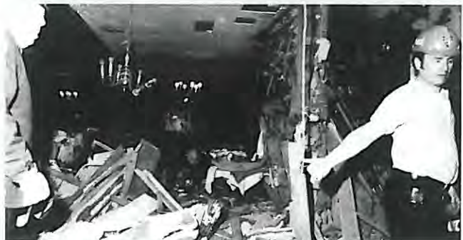
Inspecting the interior damage from the lethal bombing.