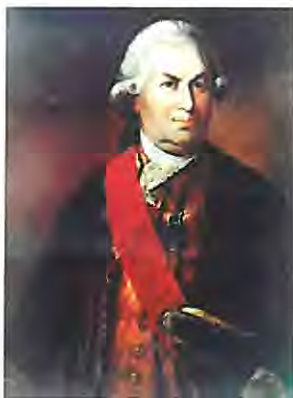
Marquis de Grasse, by Jean-Baptiste Mauzaisse (1830)

"This accident proceeded from the money which I had deposited there; it was on the ground floor and underneath was a cellar, fortunately not very deep. The floor, being too weak, had been unable to bear the weight of these 800,000 livres in silver. My servant, who lay in this room, fell down the length of a beam, but was not hurt." xvi