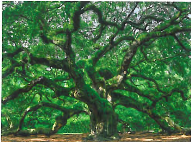
Estimated between 400-500 years old, the Angel Oak is located on Johns Island, twenty minutes from Charleston.