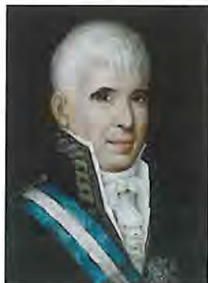
Francisco de Saavedra y Sagronis, artist unknown