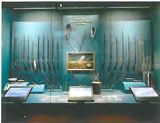
A look at the weapons used during the Revolutionary War.

was the first modern democracy, and on the ongoing responsibility to perpetuate the ideals the nation was founded on.