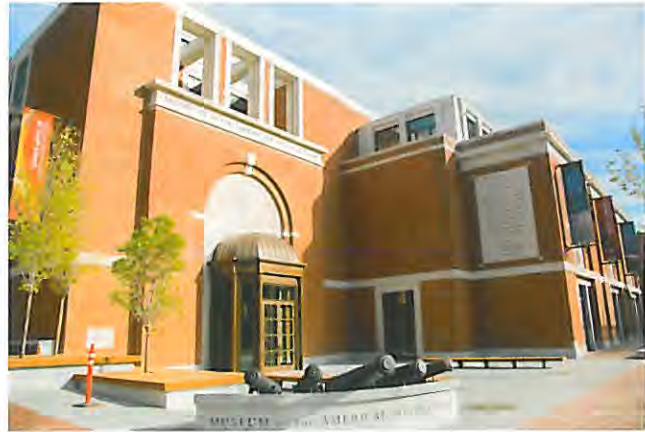
The completed building and front plaza.

At the heart of the Museum of the American Revolution is the rich collection of original historic artifacts. One of the premier collections of its kind, it includes several thousand objects from the period of the American Revolution, including a number of George Washington's personal belongings, as well as an impressive assortment of period weaponry, soldiers' and civilians' personal accoutrements, fine art, and printed works and manuscripts.