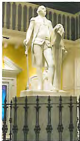
The Hubbard copy of Jean Antoine Houdon's famous likeness

A dedication ceremony was held on 1 April 2017 and featured tours of the expansive gallery exhibits, period military music, and eighteenth-century interpretive experiences in the newly expanded Continental Army encampment and Revolution-era farm on adjacent property.