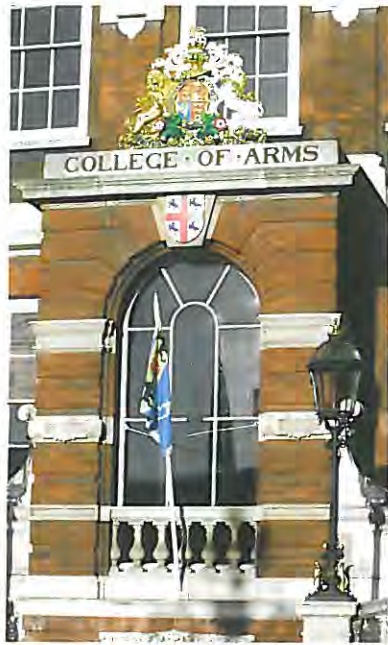
Front entrance to the College of Arms.