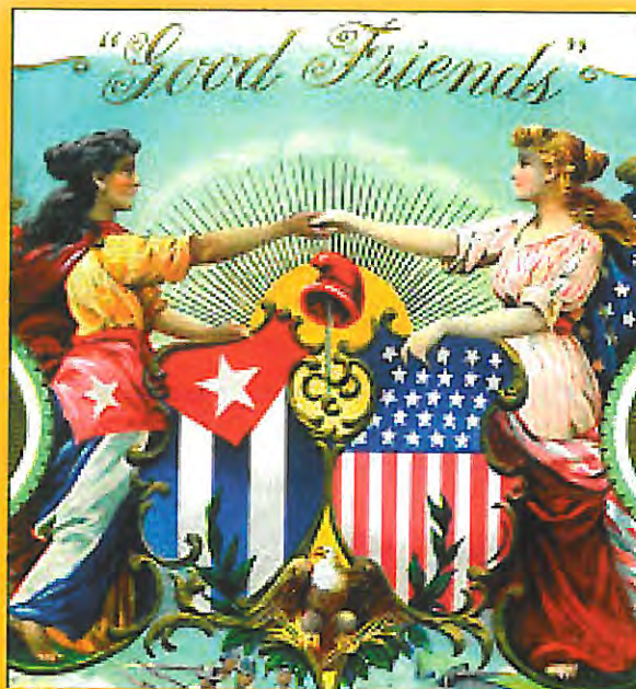
This 1898 Cuban cigar box label exemplifies US-Cuban relations during the Spanish-American War. Another period of close friendship between Cuba and the U.S. was during the Revolutionary War. See pp. 25-27.