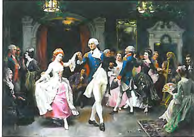
The Victory Ball of 1781, by Jean-Léon Gérôme Ferris, 1929