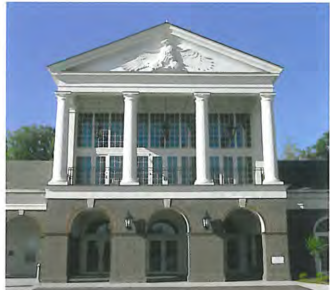
The front façade includes the "Freedom's Sentinel" sculpture on the pediment.

Through the total experience of the gallery exhibits, featuring nearly five hundred period artifacts, as well as educational films and interpretive living-history demonstrations, the American Revolution Museum at Yorktown presents an enlarged and broader perspective on the meaning and impact of the Revolution.