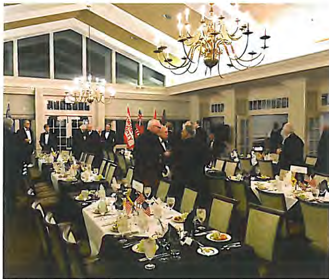
Scenes from the GA-SR's 126th Washington's Birthday Banquet.