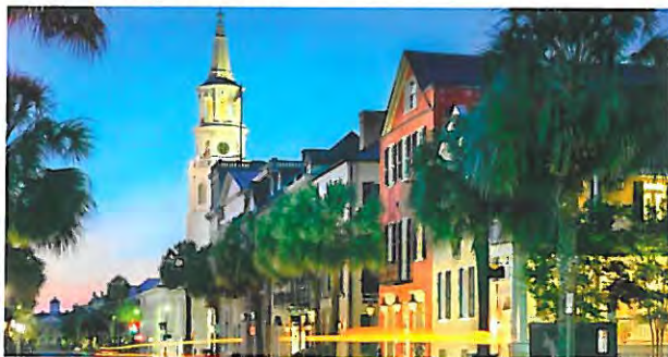
Downtown Charleston is a gem of culture, heritage, history and architecture.