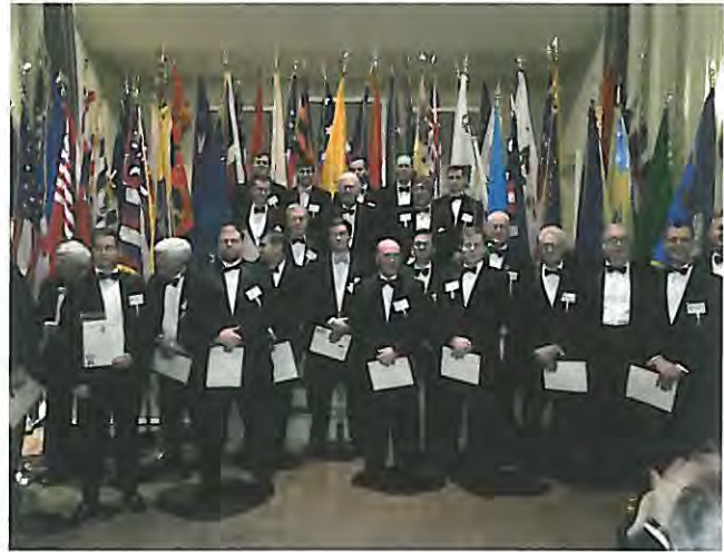
2017 Virginia Society Inductees.

The Virginia Society on 18 Feb 2017 celebrated the 285th anniversary of George Washington's birth. As has been the tradition, the venue for the evening's ceremonies was black-tie celebration at Richmond's Commonwealth Club where members