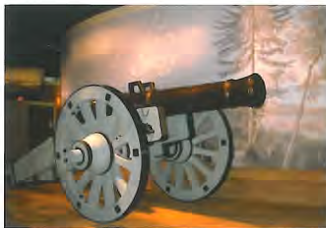
The "Siege of Yorktown Theater" features a 180-degree surround screen.