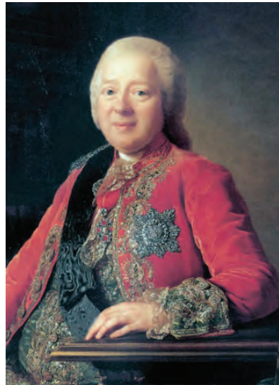
Count Nikita Ivanovich Panin, by Alexandre Roslin, 1777.