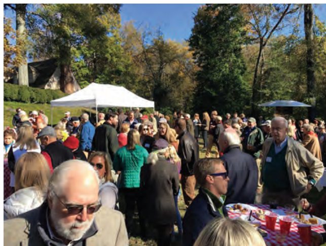
A large crowd for the eighth consecutive VSSR Oyster Roast.