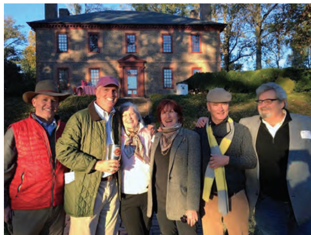
A group gives pause behind the Wilton House Museum.

This was the first to be held at the Wilton House. Serving as the headquarters of The Colonial Dames in the Commonwealth of Virginia since the 1930s, the