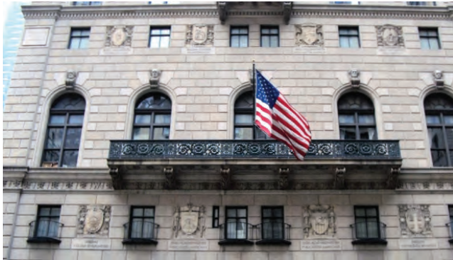
New York City's University Club, with decorative arms of Ivy League schools placed in the facade.