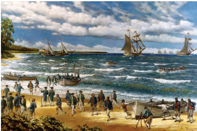
Marines storm New Providence, by V. Zveg (1973). —Source: Navy Art Collection