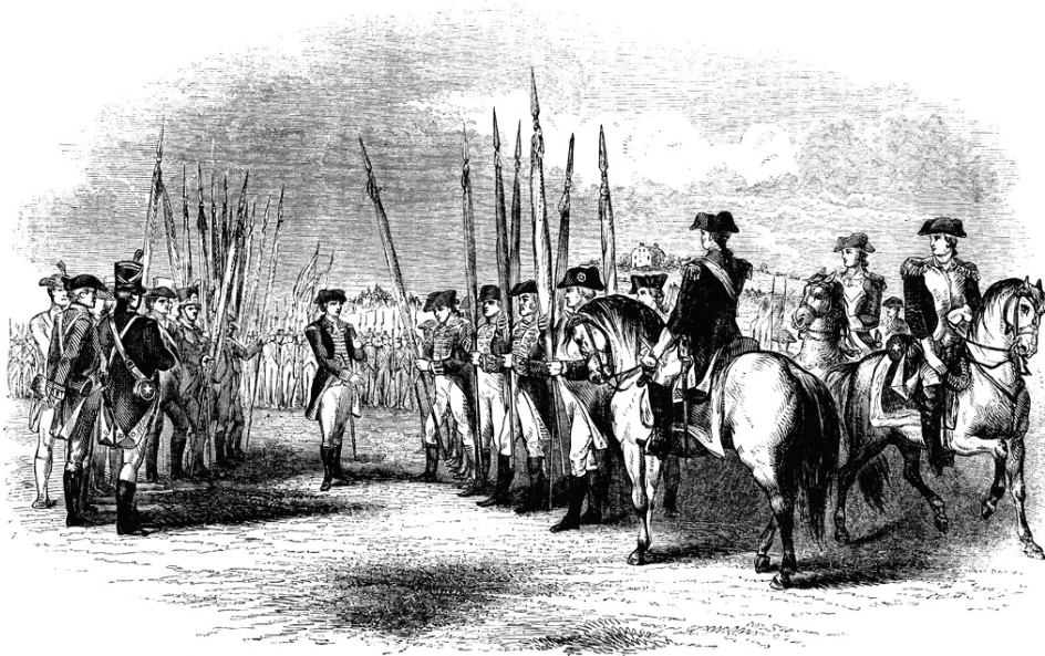
"Surrender of British Standards at Yorktown," by Benson J. Lossing, 1851