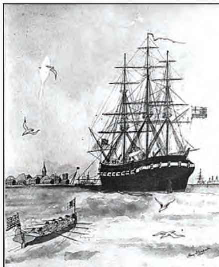
The USS Alfred , flagship of the first U.S. Naval fleet.

By this time in the mission, the American ships