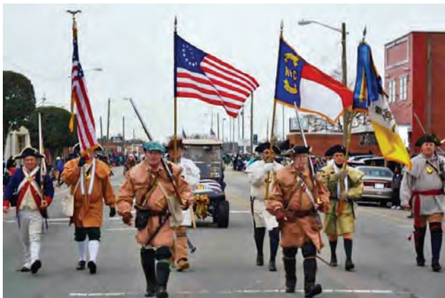
Christmas Parade in Roanoke Rapids

The SRNC Color Guard is the face of the SRNC, and the Society is proud of the work that they have done. Several members have been certified with their firelocks, which means they are able to provide volley in patriotic events. The Color Guard