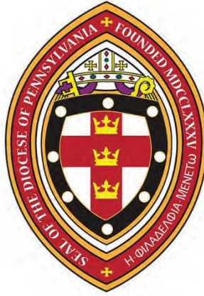
Episcopal Diocese of Pennsylvania