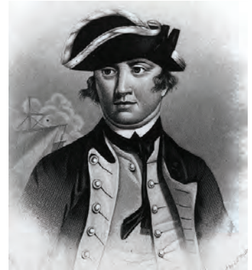
Esek Hopkins, as engraved by J. C. Buttre (c. 1875)

The Patriots occupied Nassau the following day, without bloodshed, and remained there for two weeks. Hopkins later came under widespread criticism for his actions during the mission. ■