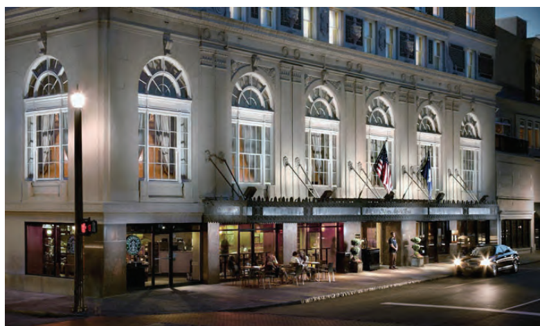
The Francis Marion Hotel, named after the Revolutionary War hero.