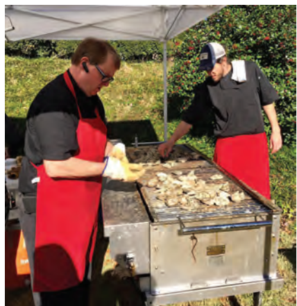
Roasting the oysters.

The Washington's Birthday Dinner event attracted a near sell-out at the Richmond Commonwealth Club, with over two hundred people attending. Then on 2 May, a record one hundred sixty members attended the Society's Annual Meeting at The Virginia House. On 12 Nov, the eighth consecutive VSSR Oyster Roast was another big hit, as it was held in the Wilton House Museum in Richmond, in collaboration with the Society of The Colonial