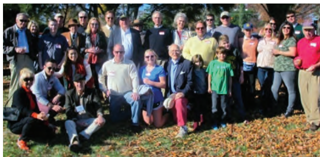
Members and guests converged for the annual Dartmouth/Princeton Football game in November. Princeton overtook Dartmouth, 38-21