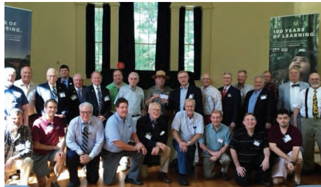
The SRNJ toured the Morristown National Historical Park, where members paused for a group photo.

On 17 Sept 2016, the New Jersey Sons of the Revolution organized a tour of the Morristown National Historical Park in Morristown, New Jersey. The park commemorates the site of Washington's winter encampment during the winter of 1779 – 1780.