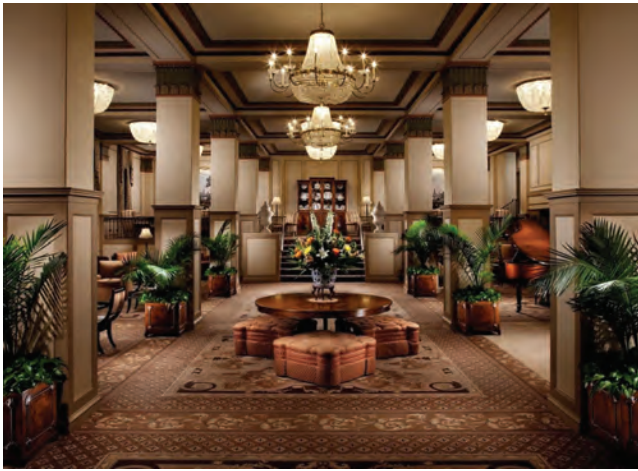
Elegant and spacious first floor, hotel interior.