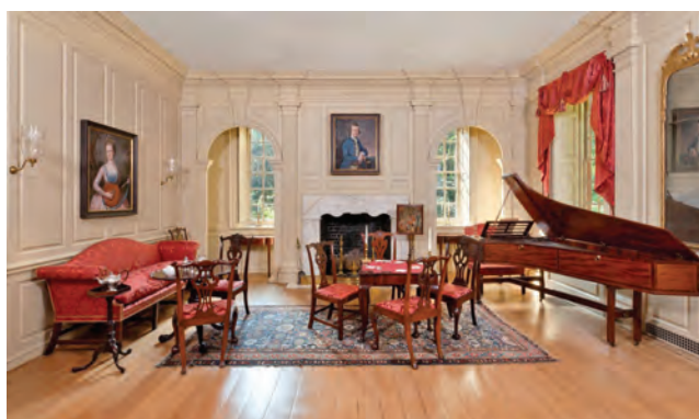
Interior room of the Wilton House Museum.

home once belonged to Virginia's highly respected Randolph family. Successive generations of the Randolphs lived there from 1753 to 1859. The Dames bought the property during the 1930s. As the twentieth century pressed forward, the organization was forced to dismantle the home, sell the original lot, and painstakingly rebuild the house at a new location, architecturally restored it to its former glory.