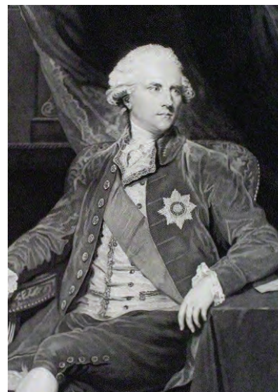
Sir James Harris, by Joshua Reynolds, c. 1786.

French to abandon their alliance with the Americans, leaving the rebels to fend for themselves, the king would not ask her to deploy any troops and might reward her with the isle of Minorca! x