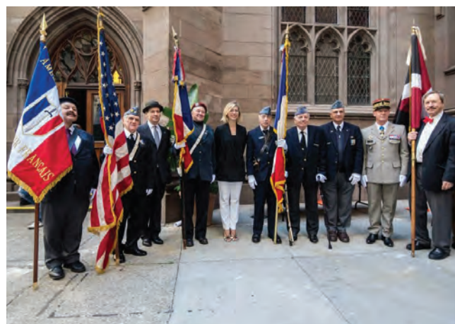
Commemoration of Saratoga-Yorktown fallen at Trinity Church, NYC.

On Sunday, 6 November, the Color Guard assembled again for the Ninety-Fifth Annual Massing of the Colors at Saint Thomas Church, Fifth Ave at 53 rd Street. This event always brings out hundreds of marchers, as various military and patriotic or-