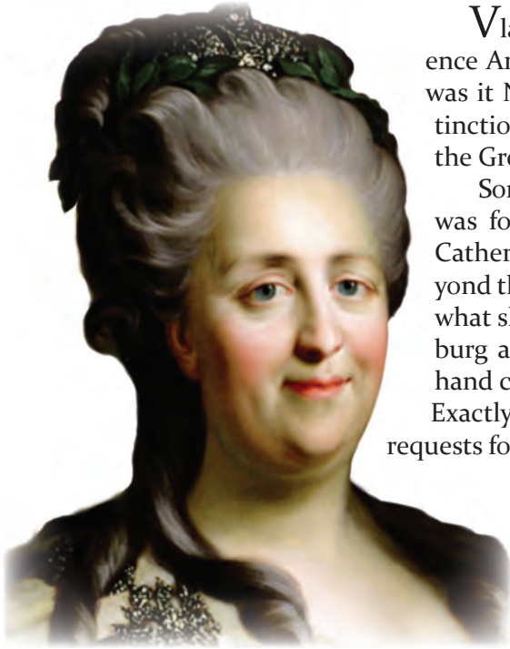
Catherine the Great, by J. P. Lampi, c. 1780s.

Vladimir Putin is not the first Russian head of state to influence American politics, policy, and presidential elections. Neither was it Nikita Khrushchev or Josef Stalin or Alexander II. The distinction belongs to Sophie Friederike Auguste, a.k.a., Catherine the Great, Empress of the Russian Empire from 1762 to 1796.