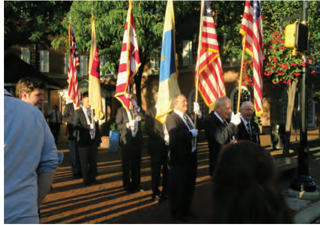
The Lancaster County Chapter Color Guard presenting during "Capital Day" celebration.