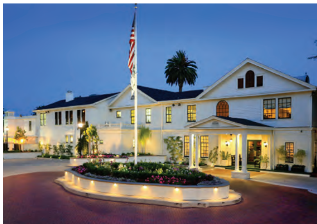
Members of The Valley Hunt Club initiated the Tournament of Roses Parade in 1890.