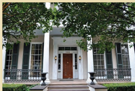
Two views of the 1849 Payne-Strachan House.