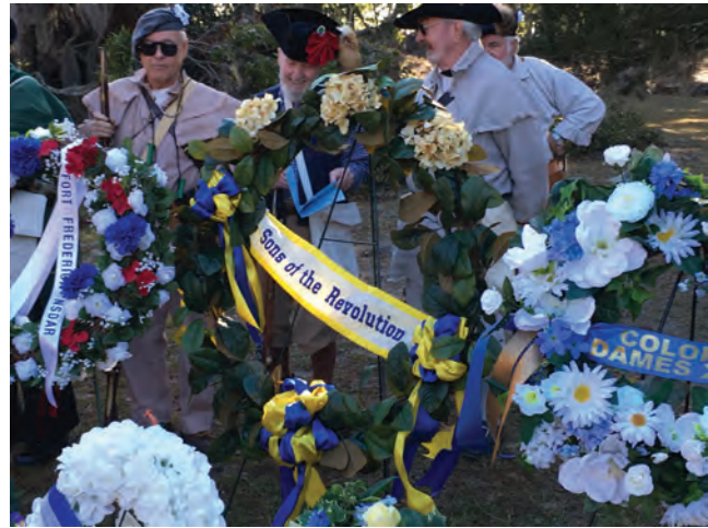
Above: A wreath presented at Fort Morris by the Georgia Society

When the British moved up from Florida and