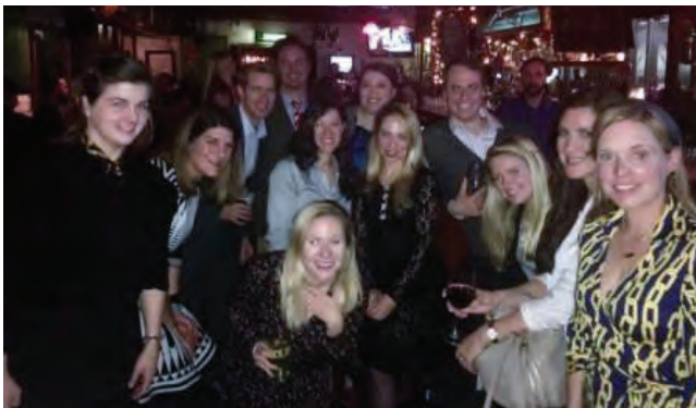
Younger Members Night at Fraunces Tavern.