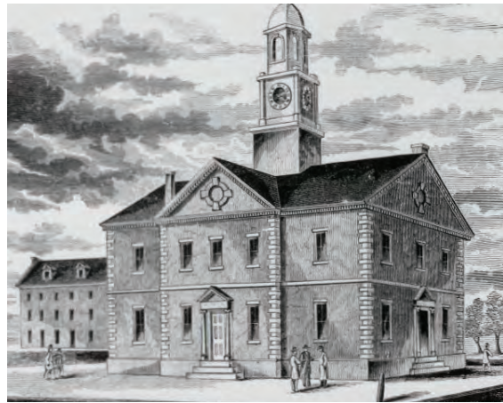
Image of the old Lancaster County Courthouse, where Congress met on 27 Sept 1777.