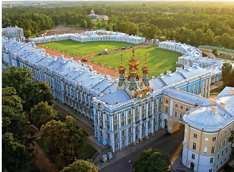
This palace, south of St. Petersburg, is named after Catherine I, mother of Empress Elizabeth. In 1743, Elizabeth commissioned an expansion of the original edifice and ordered a display of awesome grandeur to rival Versailles.

Catherine, on the other hand, readily accepted her adopted homeland, proved herself to be intelligent, flexible, level-headed, and ambitious. Whereas Peter alienated the Russian people, Catherine won them over. When Elizabeth died on Christmas Day 1761, Peter III assumed the