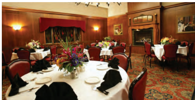
One of the interior rooms at Jax Café.