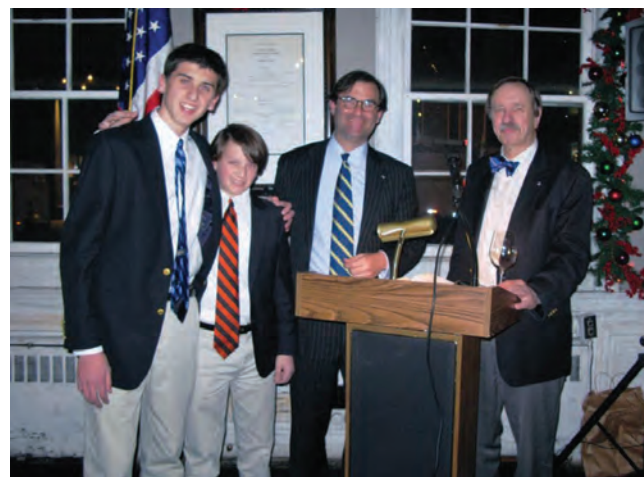
Evacuation Day Dinner at the Fraunces Tavern.—Photo courtesy SRNY