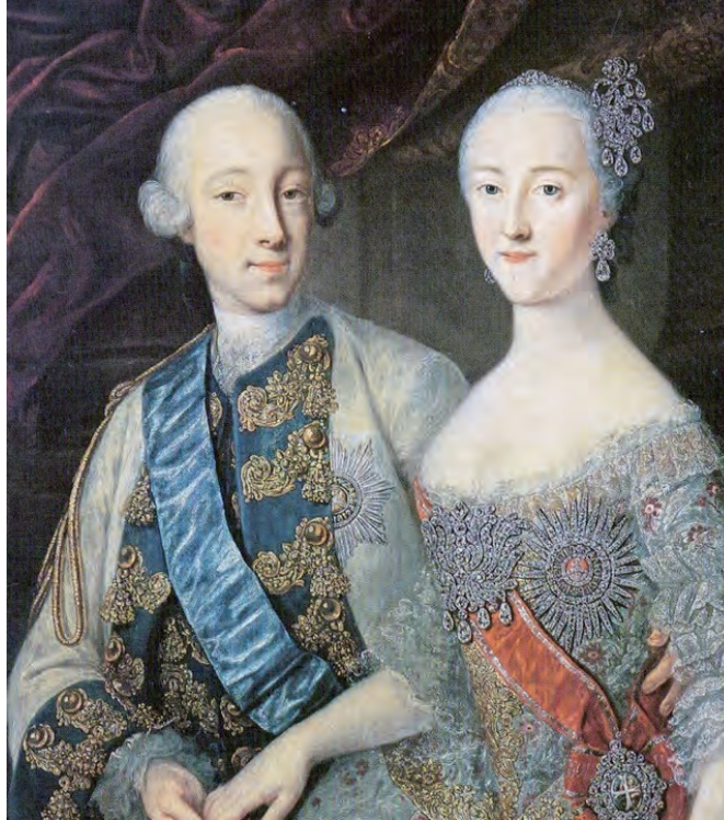
Peter III and Catherine II, by Georg Christoph Grooth, c. 1745.

By 1781, Prussia, Austria, and Portugal also joined. In 1782 the Ottoman Empire joined, followed by the Two Sicilies in 1783. Although the League did not have significant "teeth" for its enforcement, it was a powerful political statement that reverberated throughout Europe. XVI