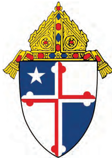
Arms of Archdiocese of Baltimore