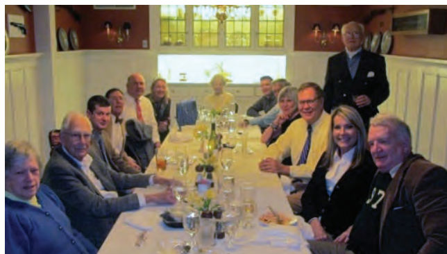
The day in Morristown began and ended at the Old Mill Inn in Basking Ridge.

Jockey Hollow Visitors Center and Wick Farm, two distinct units of the park at Morristown. At the Visitors Center a National Park Ranger gave the assembled a special introduction to the park and presented a short video on the condition of Washington's troops during the winter encampment. After seeing the park, members then toured Washington's Headquarters in Morristown, a.k.a. the Ford Mansion.