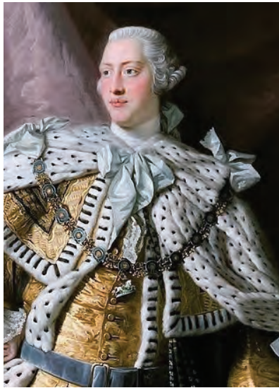
King George III, by Alan Ramsay, 1765.

The finalized offer: If the Empress would but implore upon the