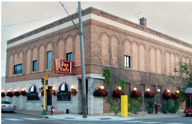
Exterior of Jax Café, a prized steak house in northeast Minneapolis, site of the Sons annual meeting.