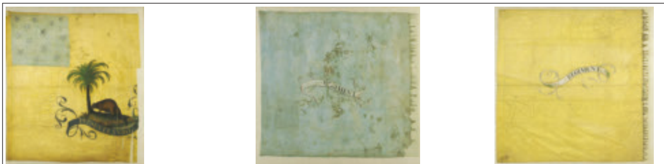
These regimental standards from South Carolina were captured by a British officer in 1779–80. In 2006, a descendant of Lt. Col. Banastre Tarleton's sold them at Sotheby's for nearly $18 million.