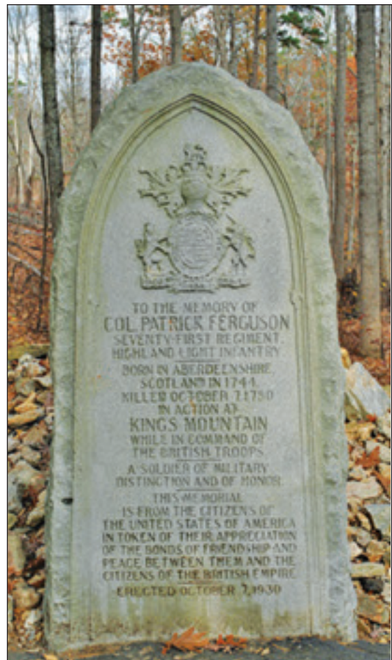
Tombstone of British Major Patrick Ferguson.

It was to the men of that area, home to Colonels Isaac Shelby and John Sevier, that Ferguson had dispatched a terse message advising them to