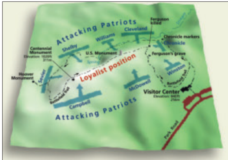
View of the battlefield looking north.