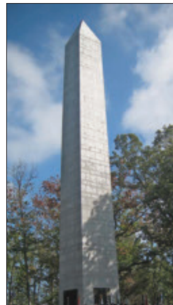
The 'Monument to Commemorate the Battle of Kings Mountain' was completed June 12, 1909. It is located at the northeastern end of Battleground Ridge where Loyalists, led by Maj. Patrick Ferguson, surrendered the victorious Patriots.