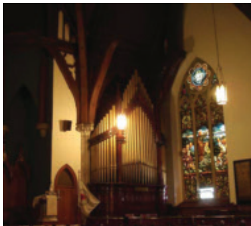
The restored organ in Zion Church.

Congress was still in session in mid-December 1799. On December 18, it received the official notice of the death of George Washington from President John Adams. Both houses promptly ceased their regular legislative business and appointed