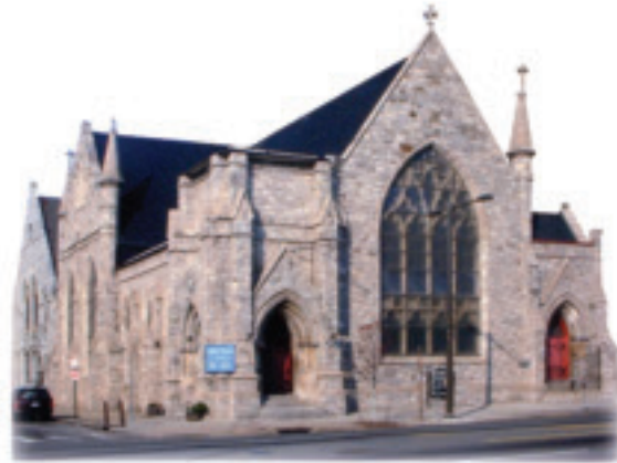
Zion Church, Philadelphia

During the War for Independence various military engagements brought him close to the city. On Christmas night 1776 he made his famous