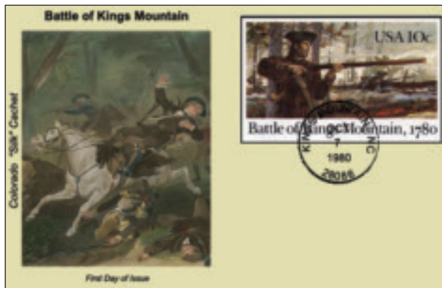
Commemorative post card marking the battle's bicentennial.