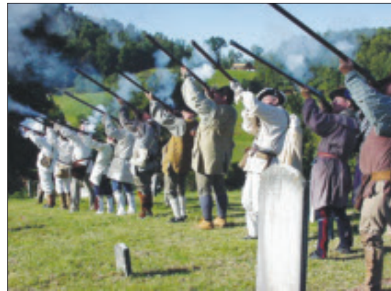
Top photo: The beauty of Southwest Virginia is visible from the Abingdon Muster Grounds.