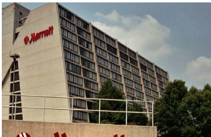
The Headquarters Marriott Hotel

Guard. Cocktails and heavy hors d'oeuvres at the Women's Basketball Hall of Fame.