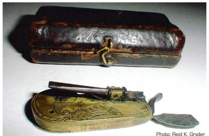
Spring Lancet with original case

Phlebotomy is a Greek word literally meaning to cut a vein, therefore the name for bloodletting instruments is Phlebotomies, and later called Phleams—which in essence are types of lancets. Basically there are two types of Phlebotomies, Phleams and Spring lancets. Phleams are usually 2, 3 or 4 bladed and fold up into their handle similar to a pocketknife. The blades are somewhat rounded near the ends and are extremely sharp. The Automatic or Spring Lancet was invented in Vienna, was first described in 1719 and soon became popular throughout the western world. This small lancet has a very sharp blade that is fixed into a small metal case and is arranged to extend in response to a spring that is released by an external lever outside the case. The cases usually are decorated with engravings.