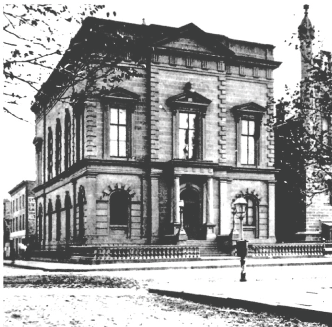
(c. 1856)

Its stated mission was to "celebrate the regeneration of the City, to promote good feelings among ourselves, and to keep alive a pride in the City and the patriotic spirit of our fathers," as quoted from Reports and Proceedings 1909-1910, Sons of the Revolution in the State of New York.