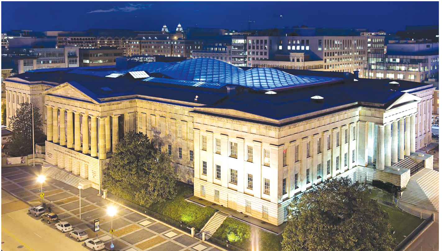
Smithsonian Museum of American Art